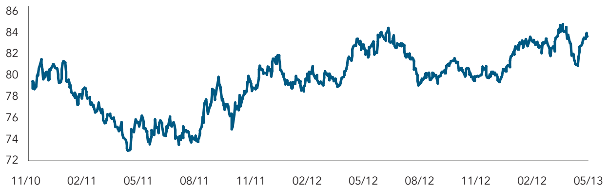
Exhibit 1 US DOLLAR INDEX

Yet, US inflation is now broadly where it was, and the US dollar is higher than when those warnings were issued (see charts below), suggesting that basing an investment strategy around supposedly expert forecasts is not always a good idea.